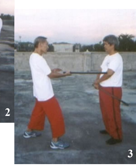
Strike No3 Forehand horizontal strike to the elbow.