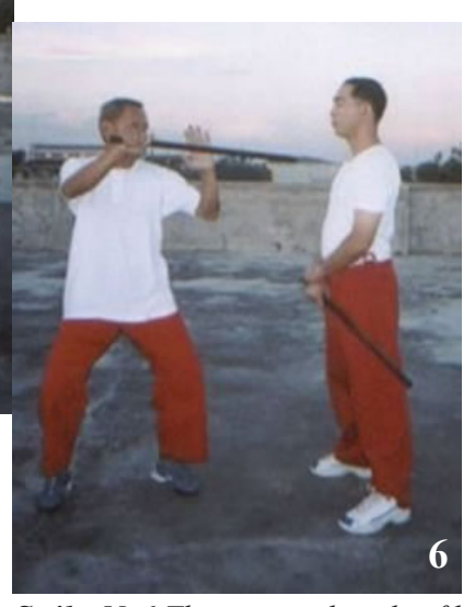
Strike No6 Thrust to right side of body.