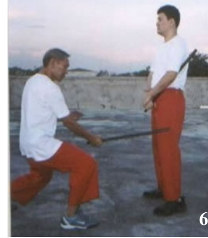
Strike No1 – Variation No6 Forehand diagonal downward strike to the knee.