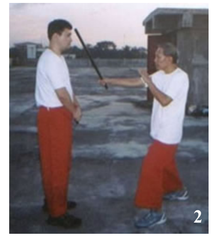
Strike No1 – Variation No3 Forehand diagonal downward strike to the neck/shoulder.