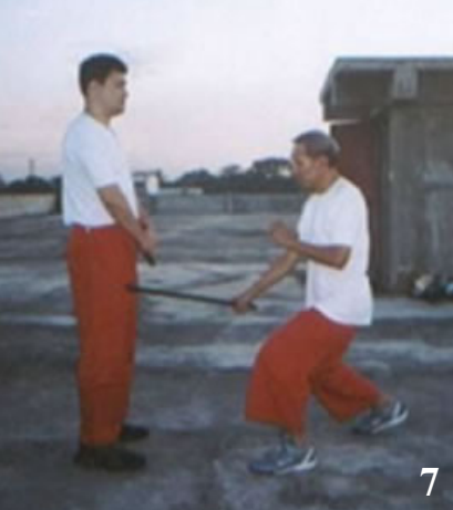
Strike No1 – Variation No7 Backhand diagonal downward strike to the knee.