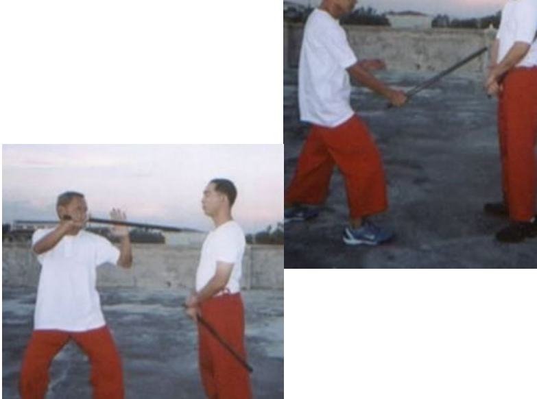
Strike No5 Thrust to the abdomen.